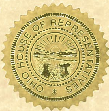
CLIFFORD A. ROSENBERGER SPEAKER OHIO HOUSE OF REPRESENTATIVES